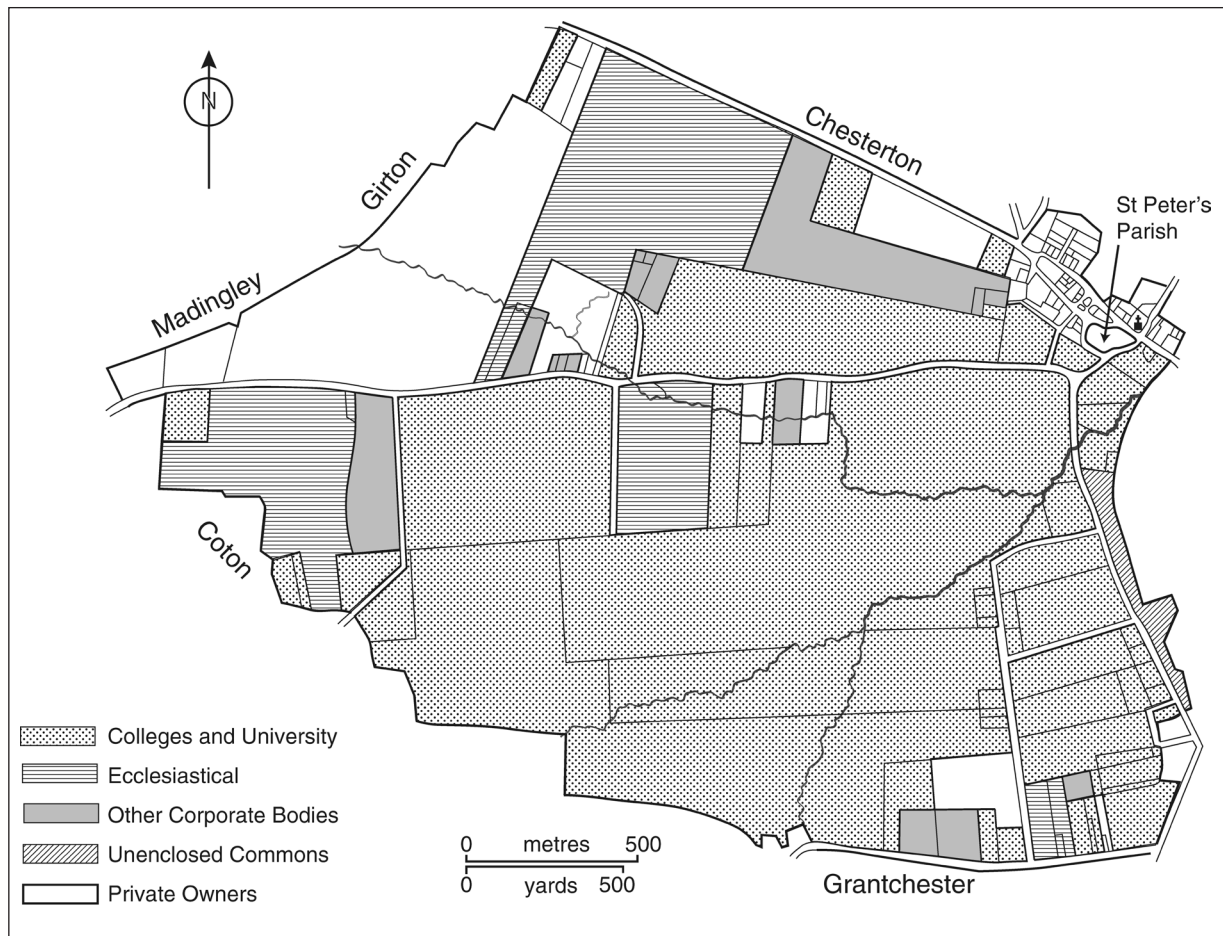
Figure 1. Ownership pattern following Enclosure of St Giles Parish, 1805.