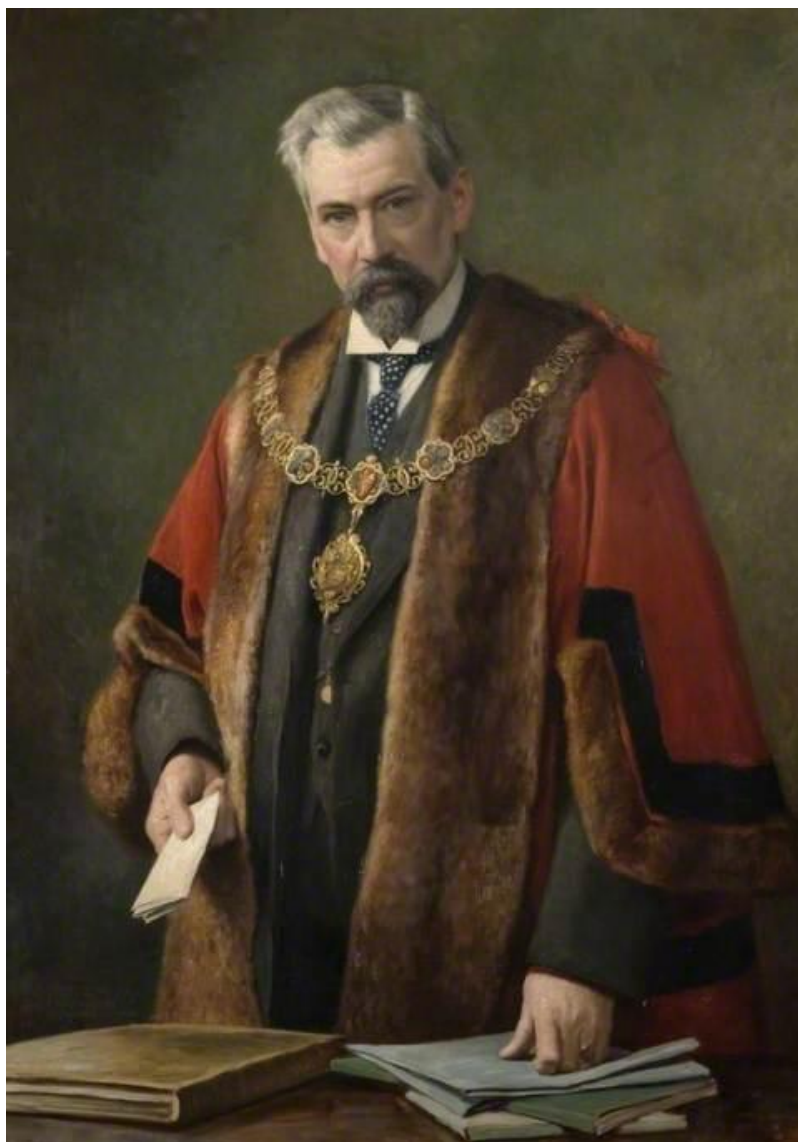
William Potter Spalding, Mayor of Cambridge 1908-10

www.cambridge.gov.uk/sites/default/files/documents/Cambridge_Mayors_1835-onwards.pdf