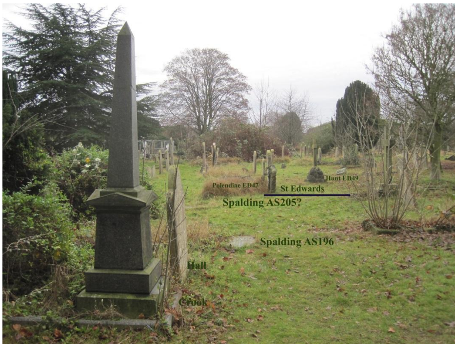
Friends of Mill Lane Cemetery, December 2016