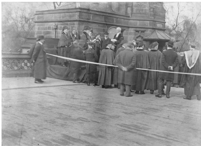
Skeldergate Bridge: removal of tolls April 1914

The Yorkshire Evening Post described him as “a man of great personal charm, extreme courtesy and pleasant temperament”. Photographs of him in the York library archives show that he wore his professional wig even when attending outdoor events, such as the ceremony relating to the removal of tolls from a local bridge on 1 April 1914.