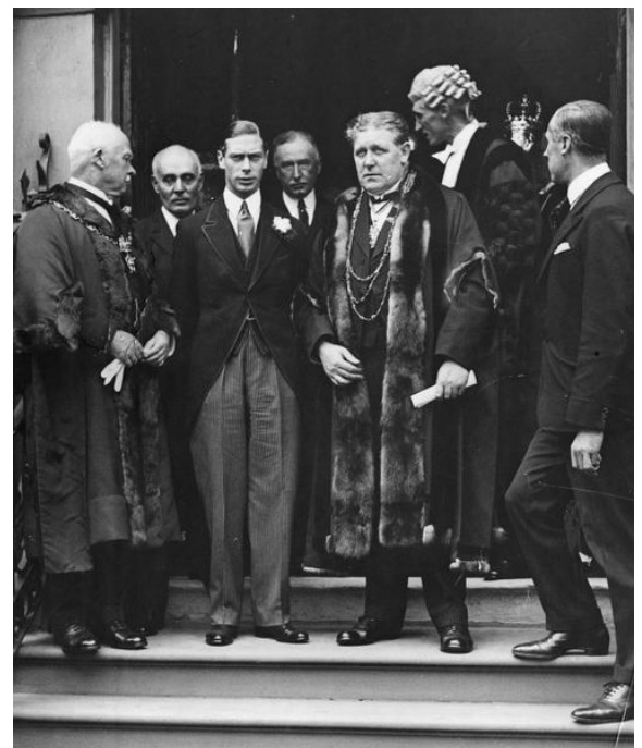
Visit of Duke of York 1924