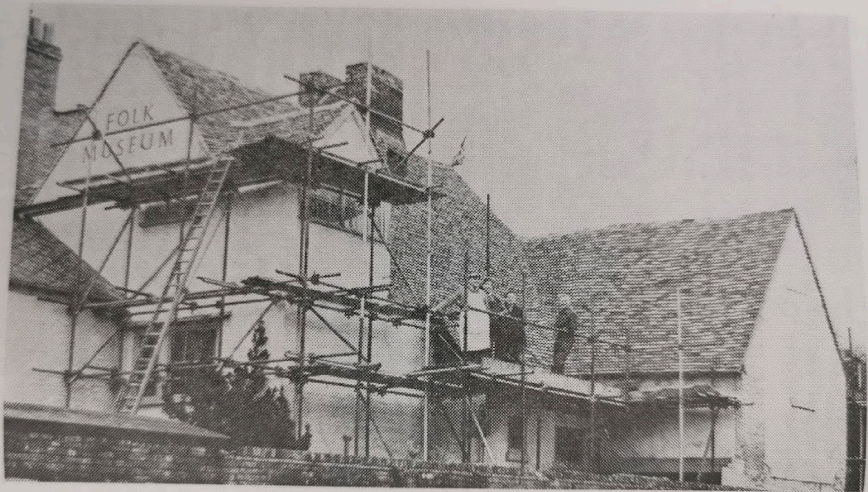
"Sealing the Roof" by hoisting a flag on completion of re-roofing, 11th January, 1958.