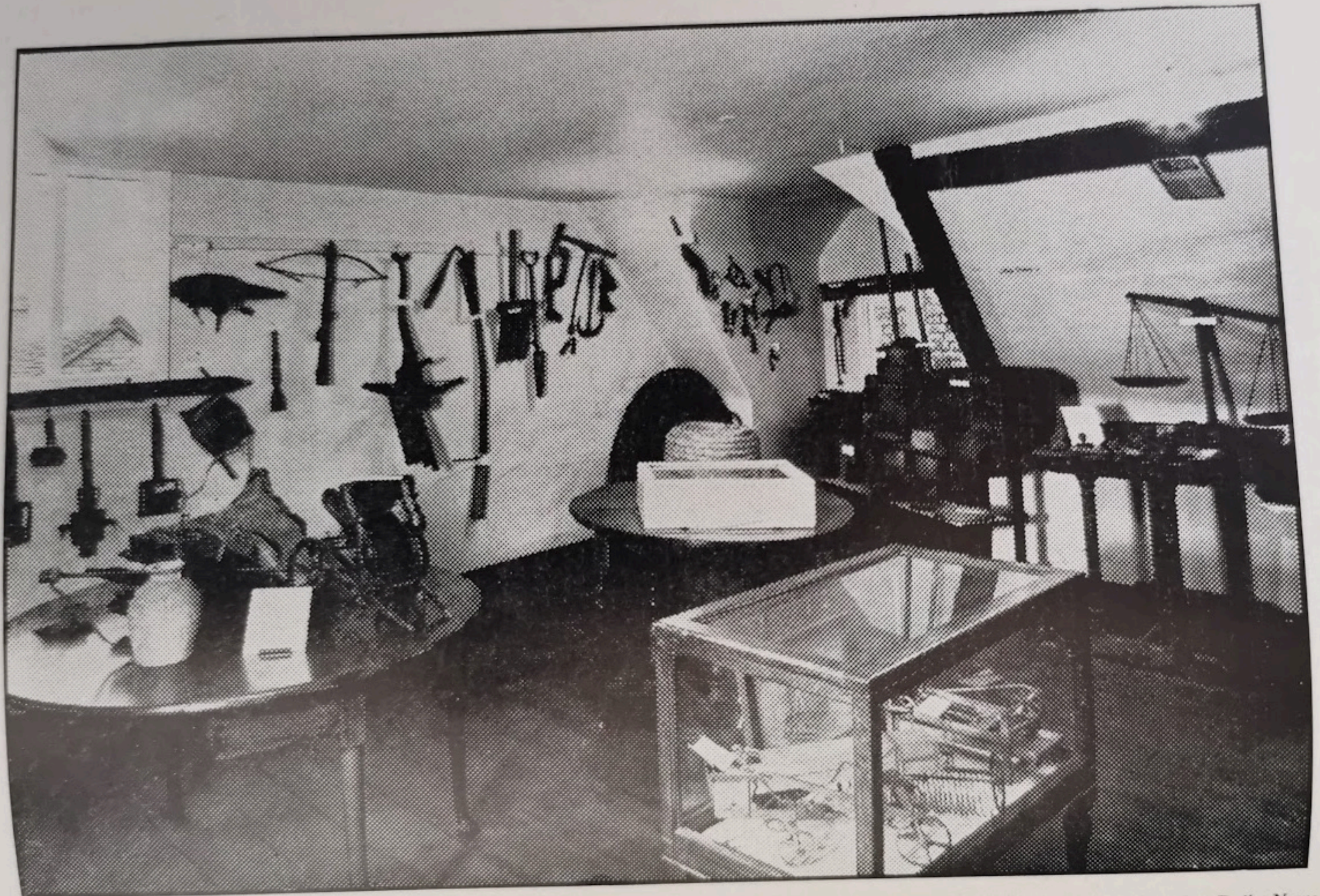
Part of the Rural Life Room