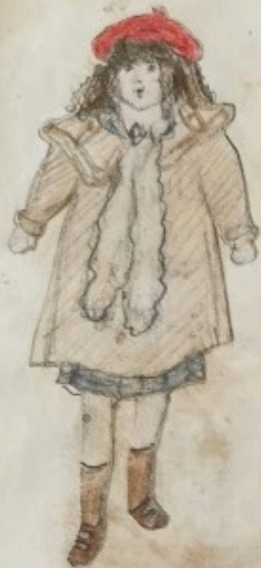
Hilda. 6 Myrtle 1900.