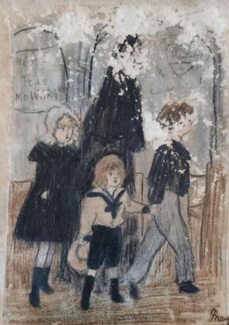
May. 1899. The widow and her children walked up the aisle!