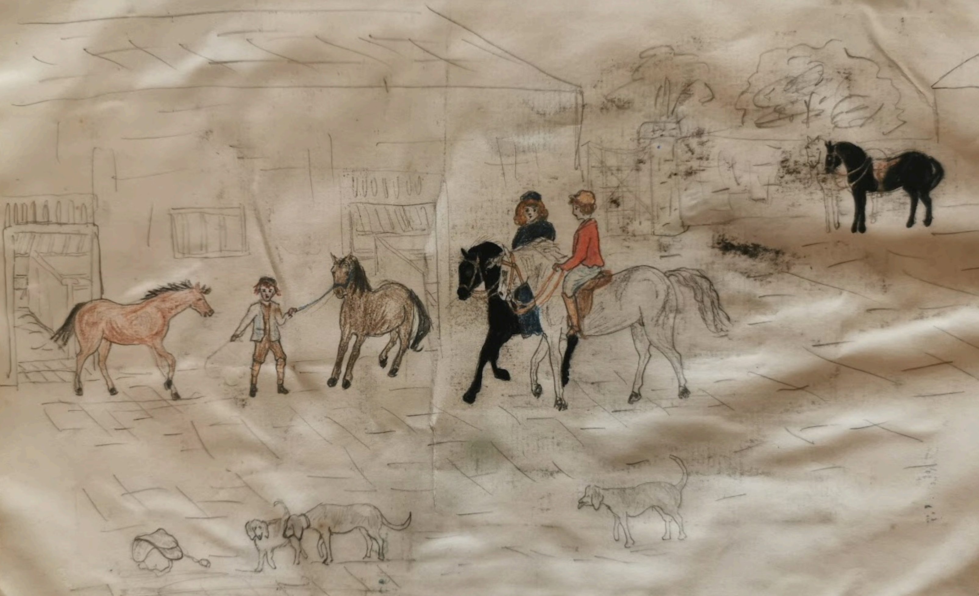
Bee Beatrice and Ben rode into the stable yard together.