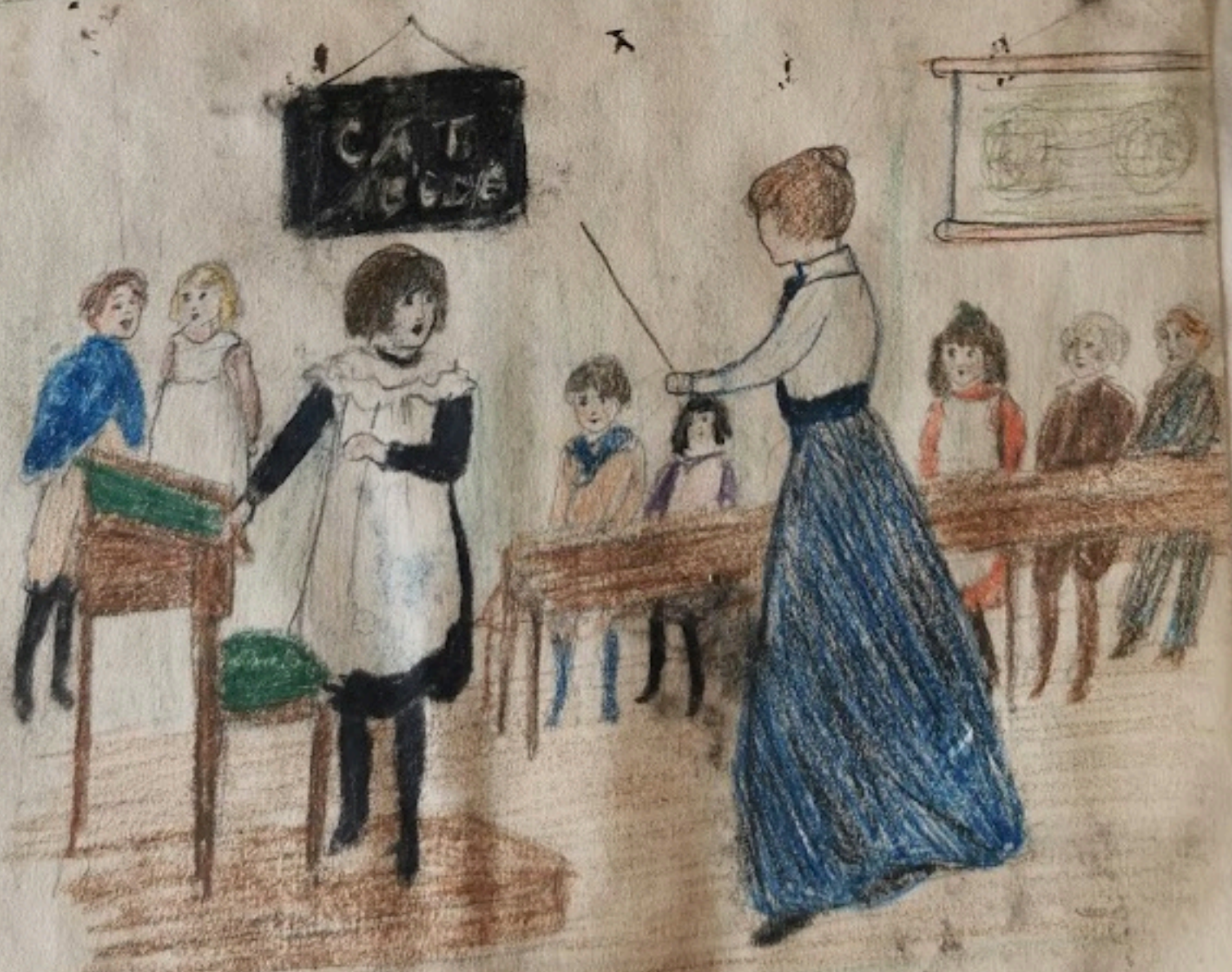
Dolly was just shutting the desk as Miss Wilkenson rushed in.