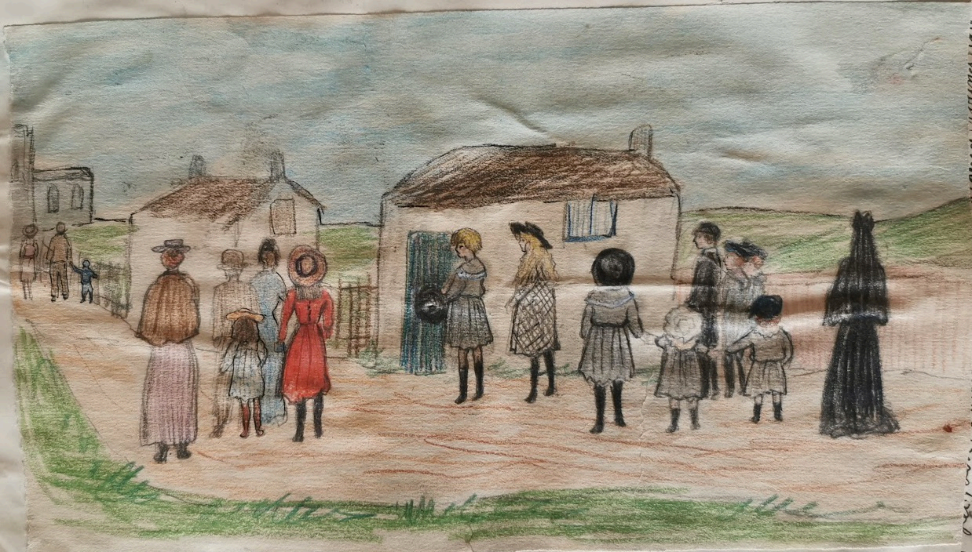
"The Widow and her children were walking to Church." June 18 99.