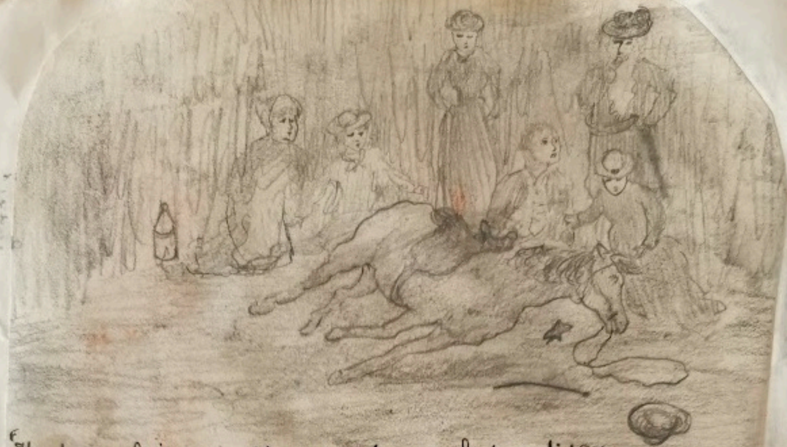
The pony lying on the ground, and hat, whip, and gloves April 1899. was all that remained of the unfortunate countess.