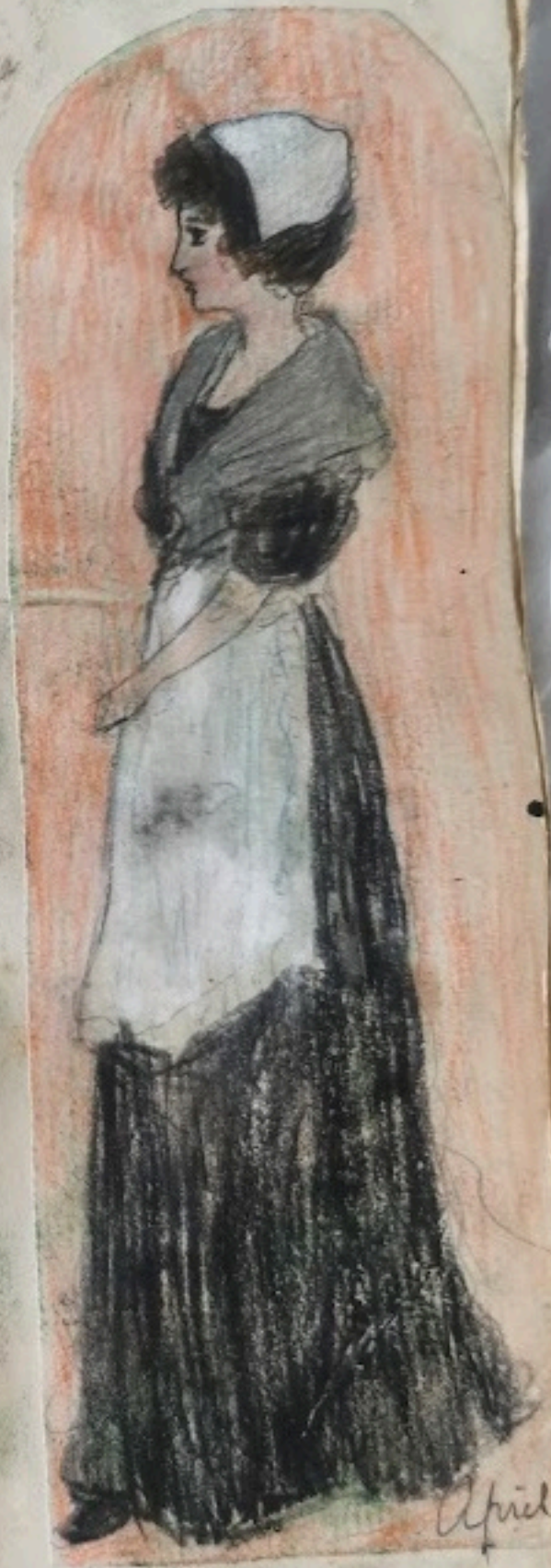
Lottie and Dolly at Tib's grave.