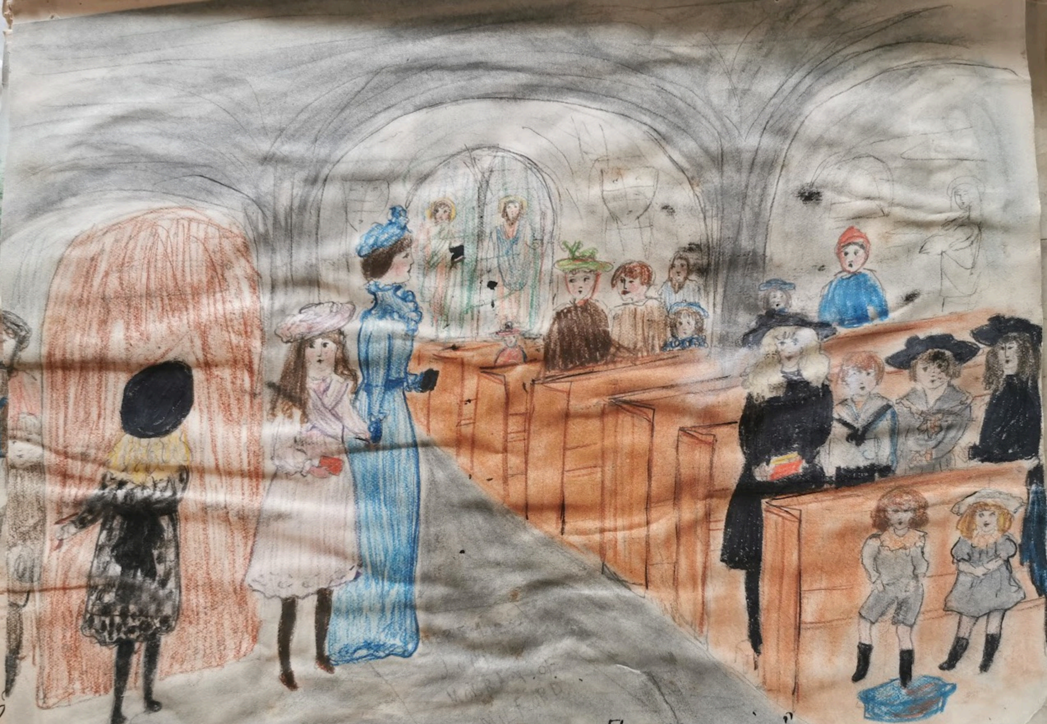
"Dorothy McBray gazed full at little courtesey as they came in"