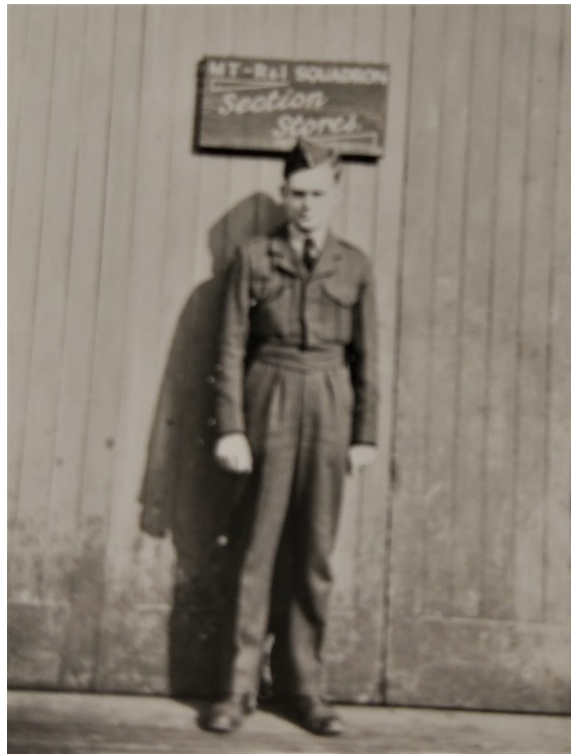
In the RAF in Wiltshire