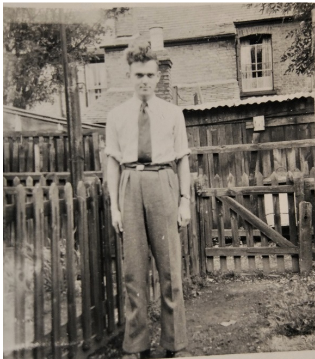
In the garden at Springfield Road