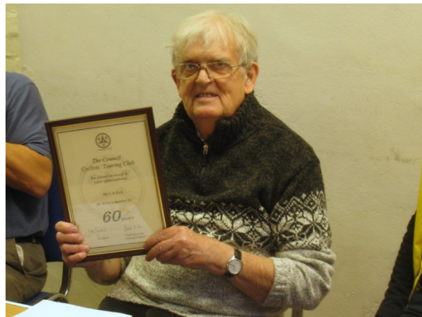
With the certificate recognising his 60-year membership of CTC in 2014.