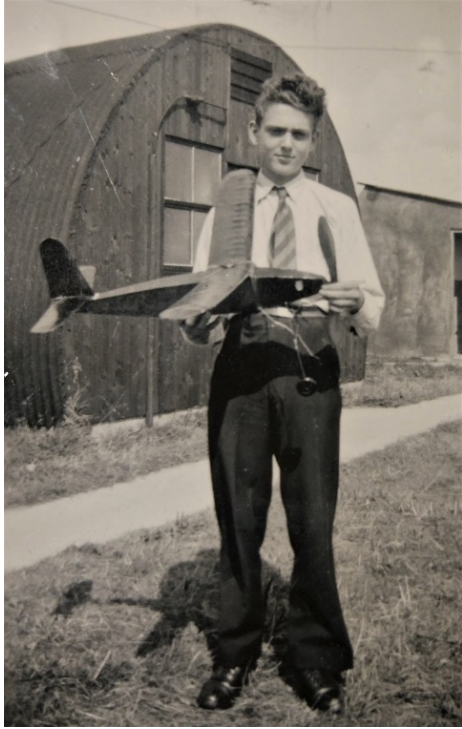
During this time, he flew model aircraft with Cambridge Model Aeronautical Society at Marshall's Aerodrome (now Cambridge airport).