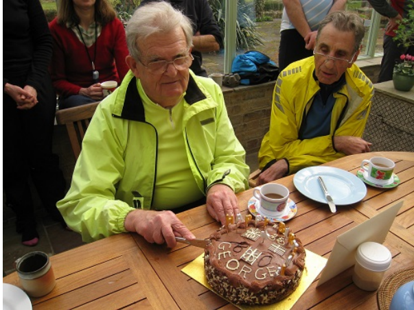
Celebrating his 80 th birthday in 2010