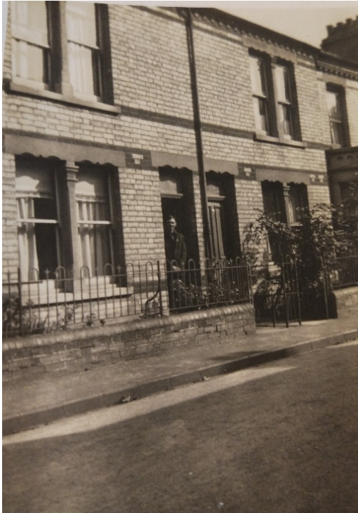
26 Springfield Road. The railings show this was taken before World War 2 when metal like this was collected to make armaments