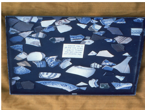
Archaeological pottery fragments from local contexts.