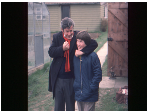
Named individuals connected with the museum.