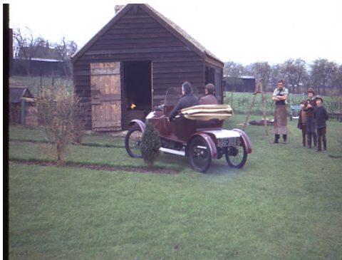
Blacksmith's workshop alongside an early motor vehicle.