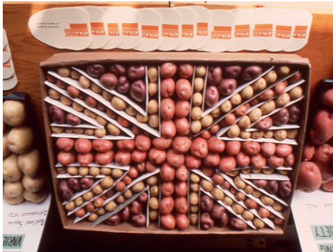
Display from the museum's popular Potato Day event.