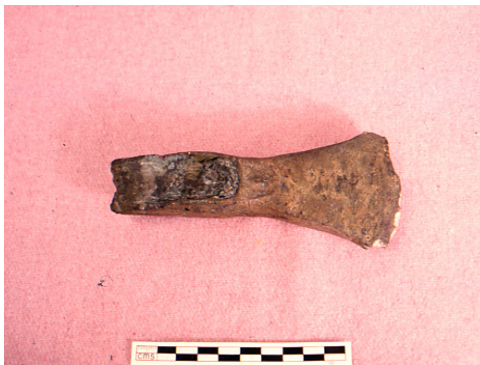
Archaeological specimen showing the museum's archaeological interests.