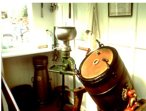
Traditional dairy reconstruction with period equipment.