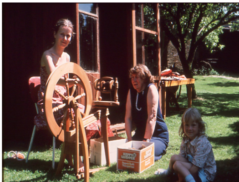
Traditional spinning demonstrated during a craft day.