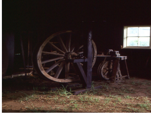
Traditional lathe demonstrating rural craftsmanship.