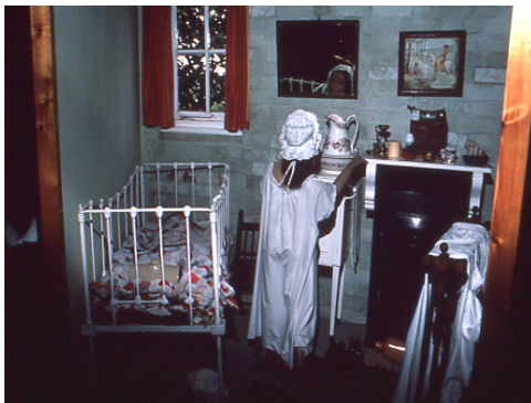
Reconstructed period bedroom showing domestic life in rural East Anglia.