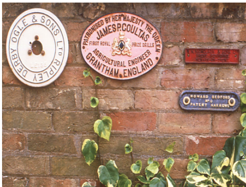
Collection of cast-metal trade and engineering signs.