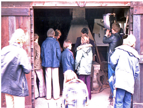
Visitors examining blacksmithing exhibits.