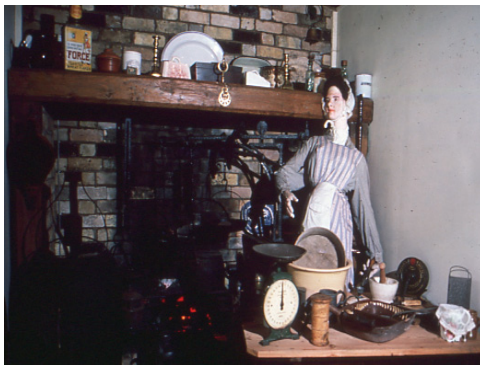
Historic kitchen reconstruction.