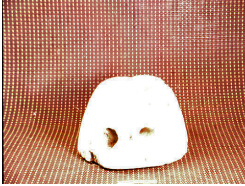
Ancient grain-grinding stone.