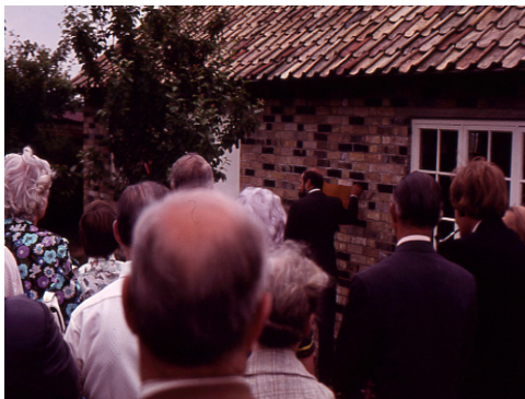
Photograph associated with the museum's official opening.