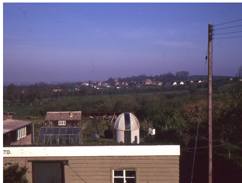
View of the observatory and museum grounds.