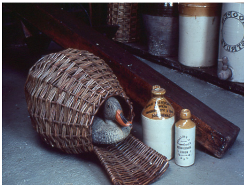
Traditional basketry display illustrating rural crafts and fenland traditions.