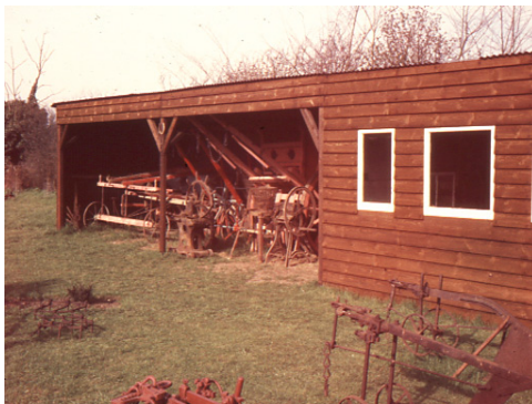
Agricultural seed drill illustrating mechanisation.