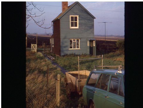
Isolated fenland dwelling and landscape.