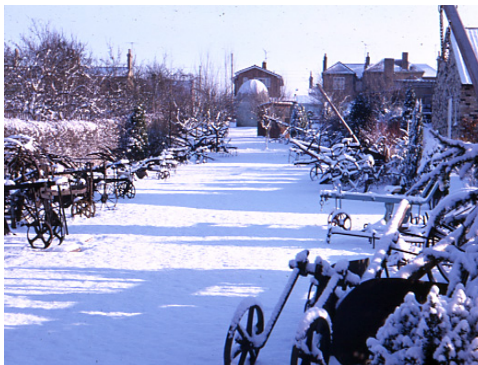
Agricultural machinery displayed during winter.