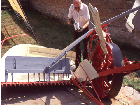
Traditional reaper associated with agricultural preservation activities.