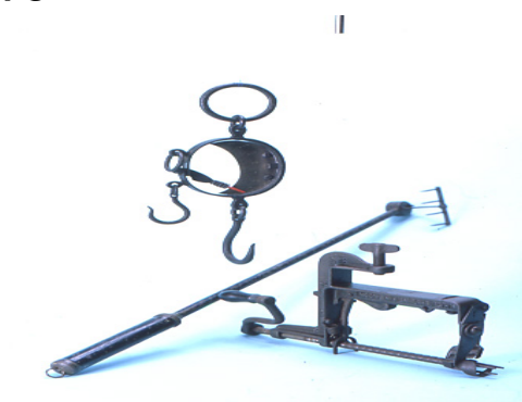
Display of Victorian household and workshop technology.