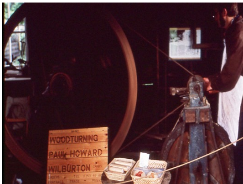
Woodworking machinery used by wheelwrights.