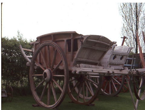
Traditional agricultural transport carts.