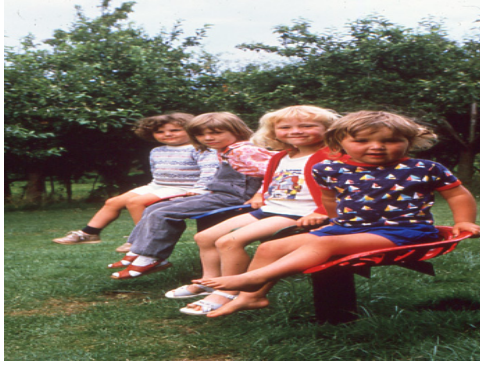
Children enjoying a museum event.