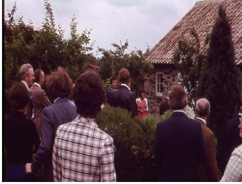
Guests attending an official opening ceremony.