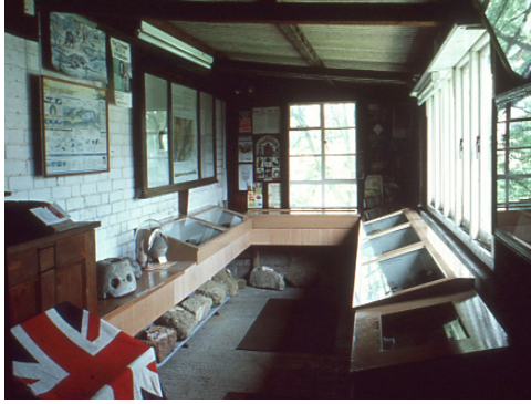
Display cases in a newly developed exhibition space.