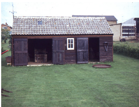
Core exhibit demonstrating the rural blacksmith's trade.