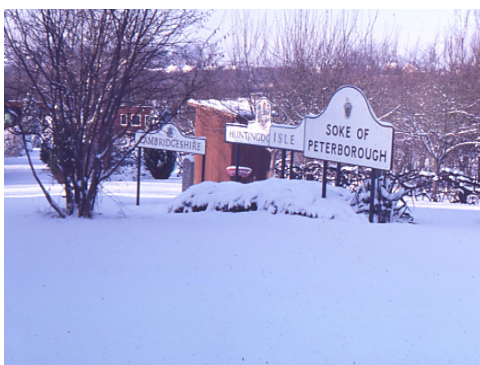
Snow-covered museum grounds and observatory.