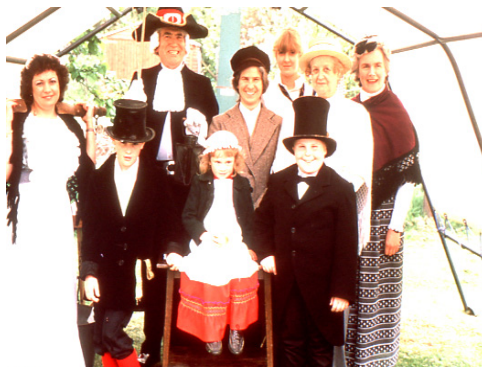
Staff and volunteers in costume during an event.