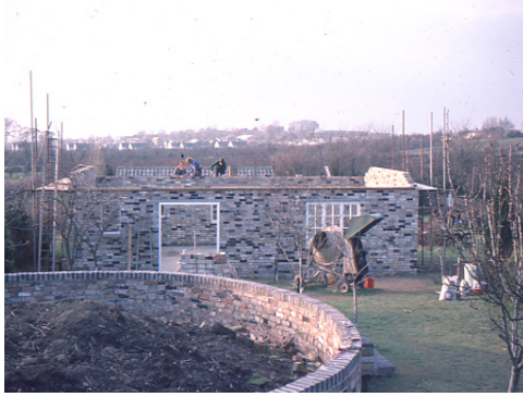
View of the bandstand and museum buildings recording the layout of the site.