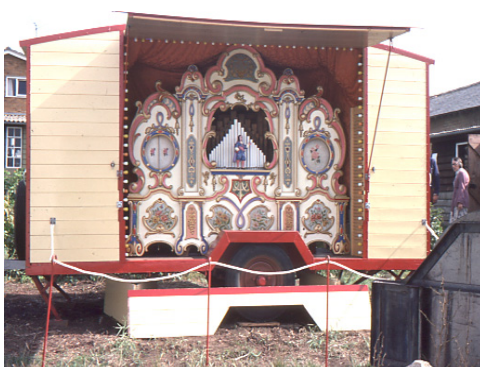
Decorative fairground steam organ.