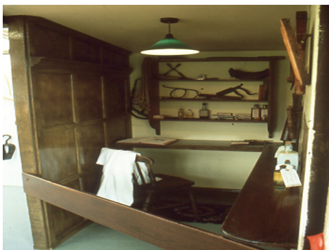
Reconstructed veterinary surgery.