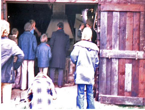
Additional view of the reconstructed smithy.